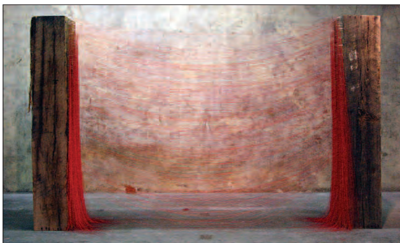
ABOVE: BEILI LIU Stalemate Installation view (Vessel Gallery, Oakland, CA)

Maple, graphite, string, mixed media, each element 6" x 6" x 18", 2012.