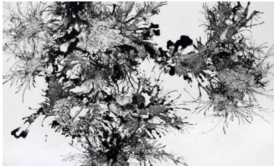
WIND DRAWINGS/ ARRAY #1 2013 | sumi ink on birch panel