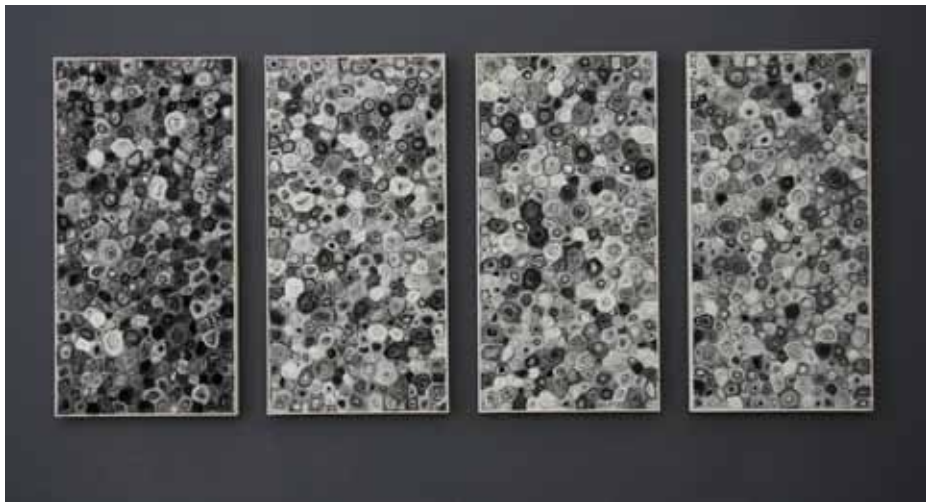
PETOSKEY 2010 | cotton (recycled), sumi ink on birch panel, set of 4